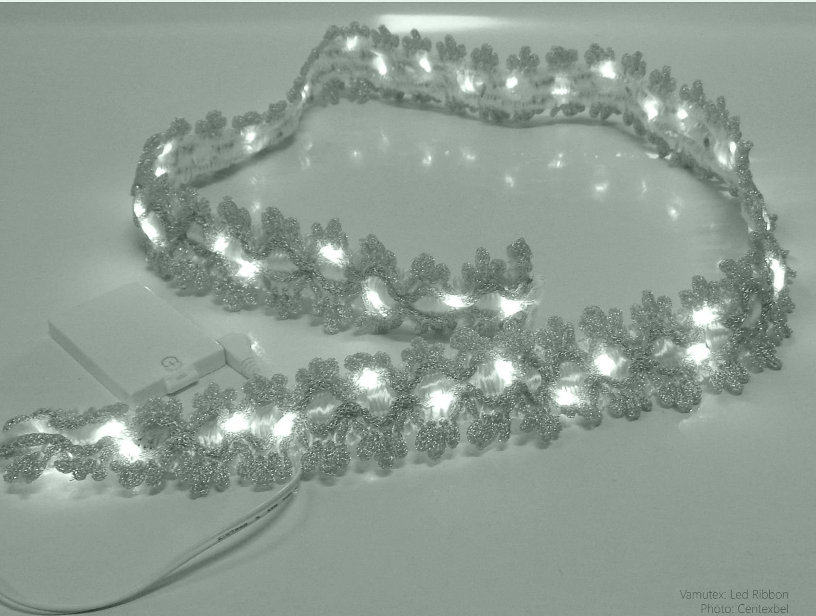
Vamutex: Led Ribbon